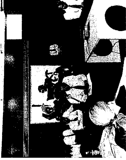
Seminar in progress

Under the topic of Doing Business in Germany, the IGCC organized a seminar on "Legal and Tax Implications of India 2 Germany" on behalf of the German consulting company 'Kestler Mielert Otto' on the 5 th of October at the IGCC Mumbai premises.